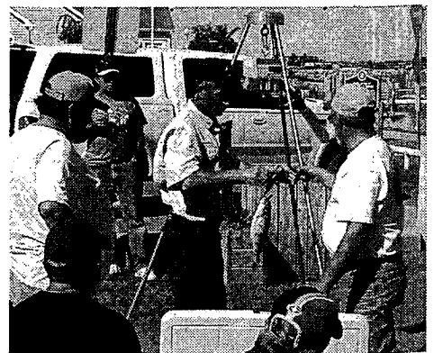
DESPERATE TIMES call for desperate measures . . . and so it went at Port Sanilac!