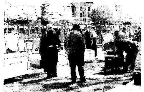
POST-FISHING PICNICS are a fun-filled highlight of most club tourneys and outings.