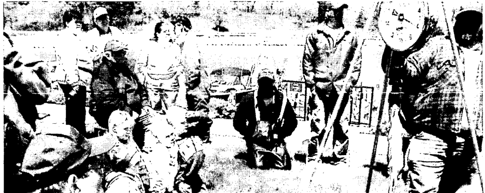
KIDS OF ALL AGES gather for the post-fishing weigh-in, a highlight which always draws a big crowd at our club tournaments.