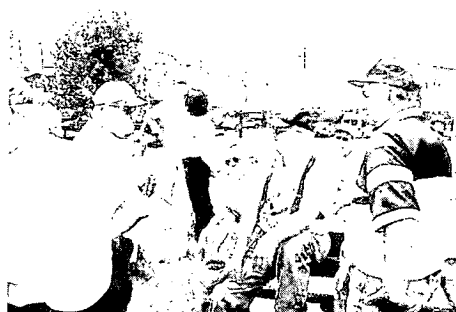
DETROIT STEELHEADERS landed 358 fish at Grand Haven over the weekend!