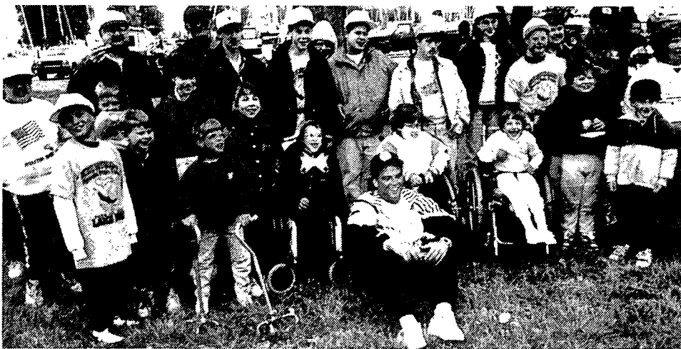
THE ANNUAL SPECIAL PEOPLE OUTING is one of the real highlights of our year!

Crew assignments will be made Saturday at about 7:30 a.m. at our tent headquarters near the marina bath house, with the picnic and