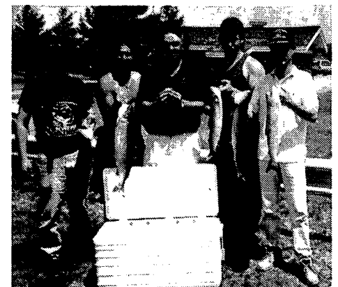
1st Place (Team Doubles): "BLUE STAR" and "MARY K" crews.