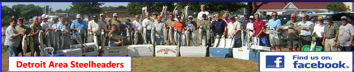
Detroit Area Steelheaders