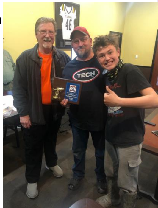
Equalizer, 2020 Big King

"But wait There's more." We normally do our club's competition award's for SOTY, AOTY, big fish award's, Director, and member of the year during our annual meeting in December. As you can assume, we were not able to do that due to Covid. At last month's meeting we were finally able to do in-person award's and recognize those successful anglers. Great job everyone.