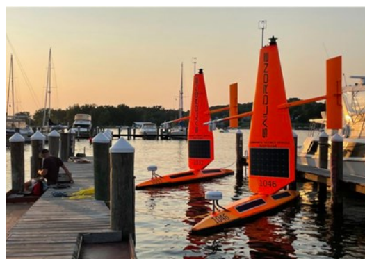
The pair of Saildrones deployed July 28 from Macatawa into Lake Michigan by USGS and Saildrone, Inc.