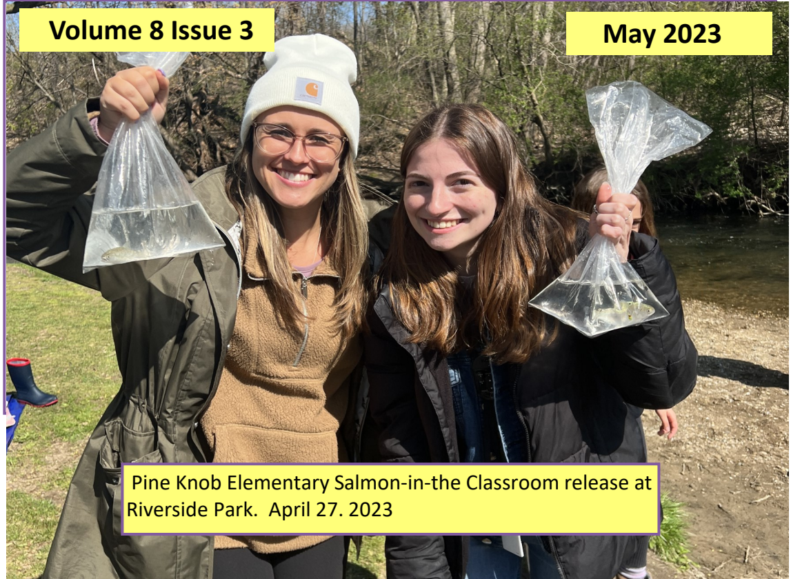
Pine Knob Elementary Salmon-in-the Classroom release at Riverside Park. April 27, 2023

Check out the new Facebook group page where you can post at: www.facebook.com/groups/