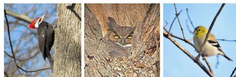
Great Backyard Bird Count 2022 at WC Armco Park