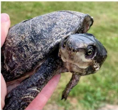
Noodle, eastern musk turtle, showing off his webbed feet at a youth fishing derby.

Warren County Park District adopted Stanley the gray rat snake and Noodle the eastern musk turtle after they were illegally taken out of the wild as youngsters and were later turned over to a state-permitted wildlife rehabilitator. Wildlife that has been kept as a pet cannot legally be released back into the wild for several reasons, including the threat of disease spread, inability of the animal to care for itself, and a lack of appropriate fear of humans and domestic pets.