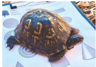
Sheldon, woodland box turtle, helping kids find shapes and patterns