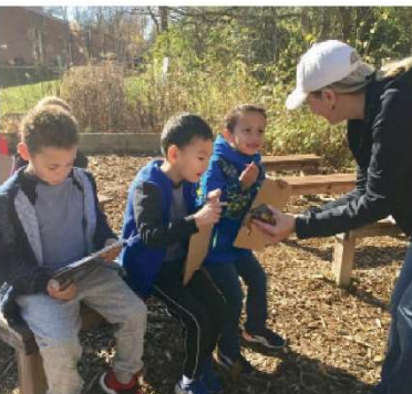
Leonard, woodland box turtle, helping kids practice observation skills.

view of how an aquatic turtle’s nose shape and long neck help it breathe air while staying hidden from predators, or how a rat snake’s patterned scales help it stay camouflaged. Even the most reluctant readers enjoy flipping through the Division of Wildlife’s Reptiles of Ohio Field Guide after meeting some real live examples. Stanley helps people understand that snakes serve an important role in the ecosystem, and that he’s not so scary once you get to know him. We incorporate lessons about native habitats and food sources, life cycles, brumation and aestivation, and what it means to be cold-blooded. We