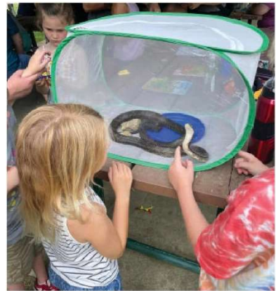
Stanley, gray rat snake, at a WCPD reptile program.

If you are an Ohio educator, you may qualify to adopt an unreleasable native reptile for your own classroom or organization. Please visit https://ohiodnr.gov/static/documents/wildlife/education/Animals%20in%20the%20Classroom%20pub009.pdf