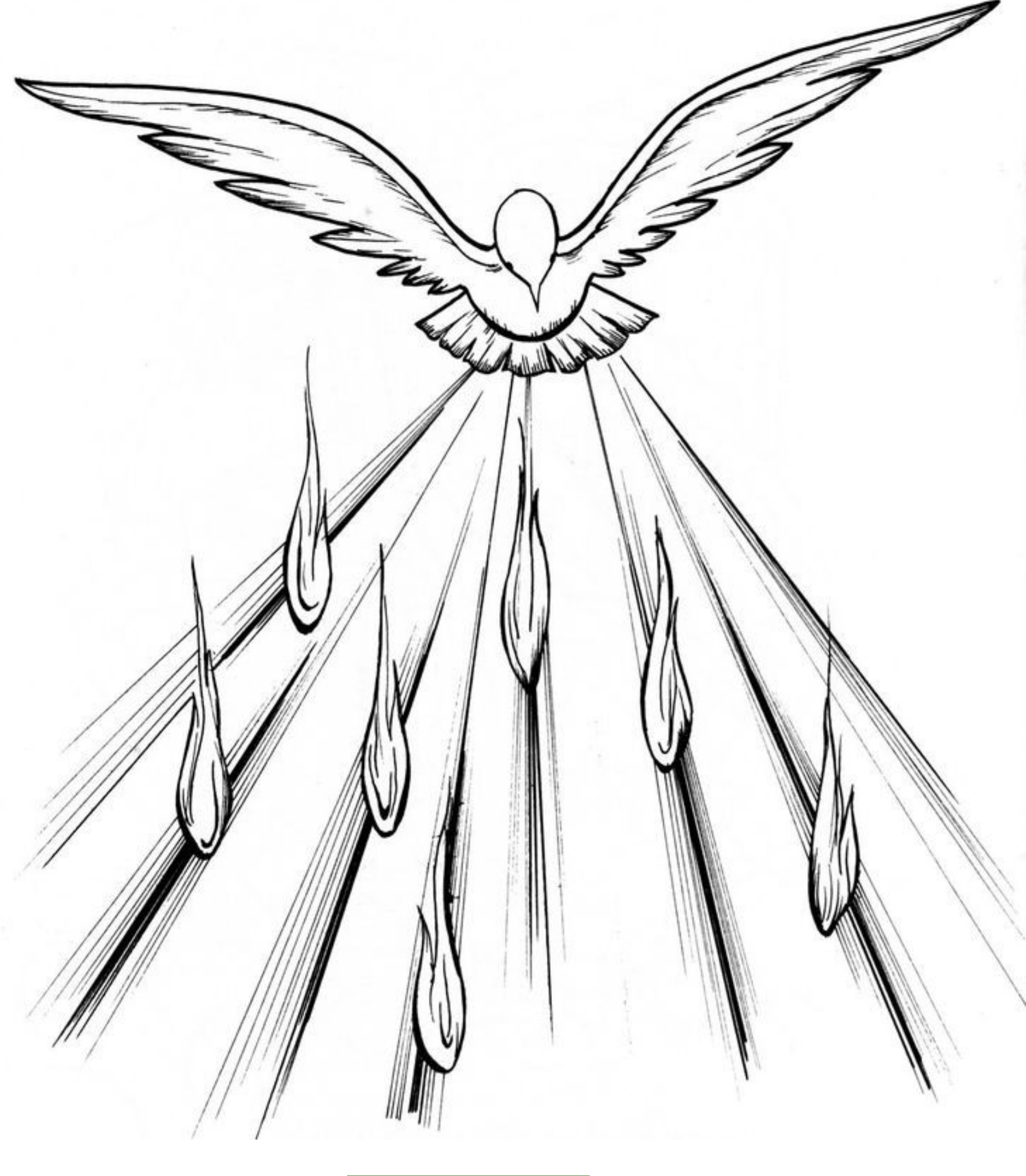
View List of Live Streams