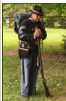
CIVIL WAR PAGE 4