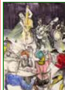
ART SHOW PAGE 4