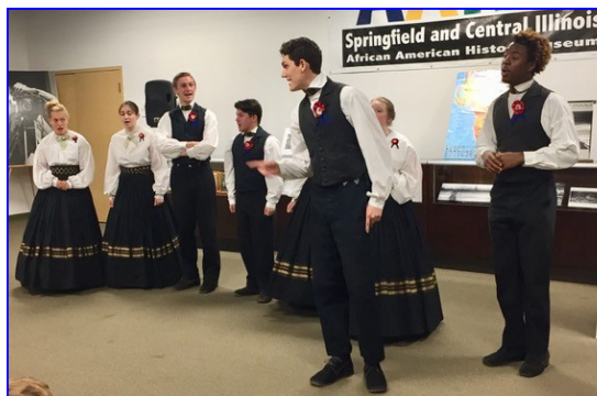
JOURNEY TO GREATNESS