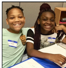
AAHM Summer Camp 2019 PAGE 6