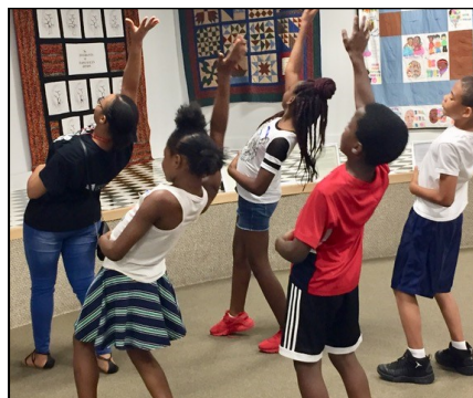
DANCE AND FITNESS

Register now by going to spiaahm.org or visit the Museum office. $25 holds a spot. Deadline is June 28. Camp is limited to 25 campers. Questions? call 217.391.6323.