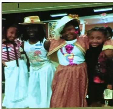
COSTUMES AND CHARACTERS