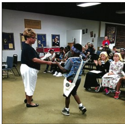
PRIZES AND AWARDS