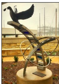
Race Riot Remembrance opens at HSHS