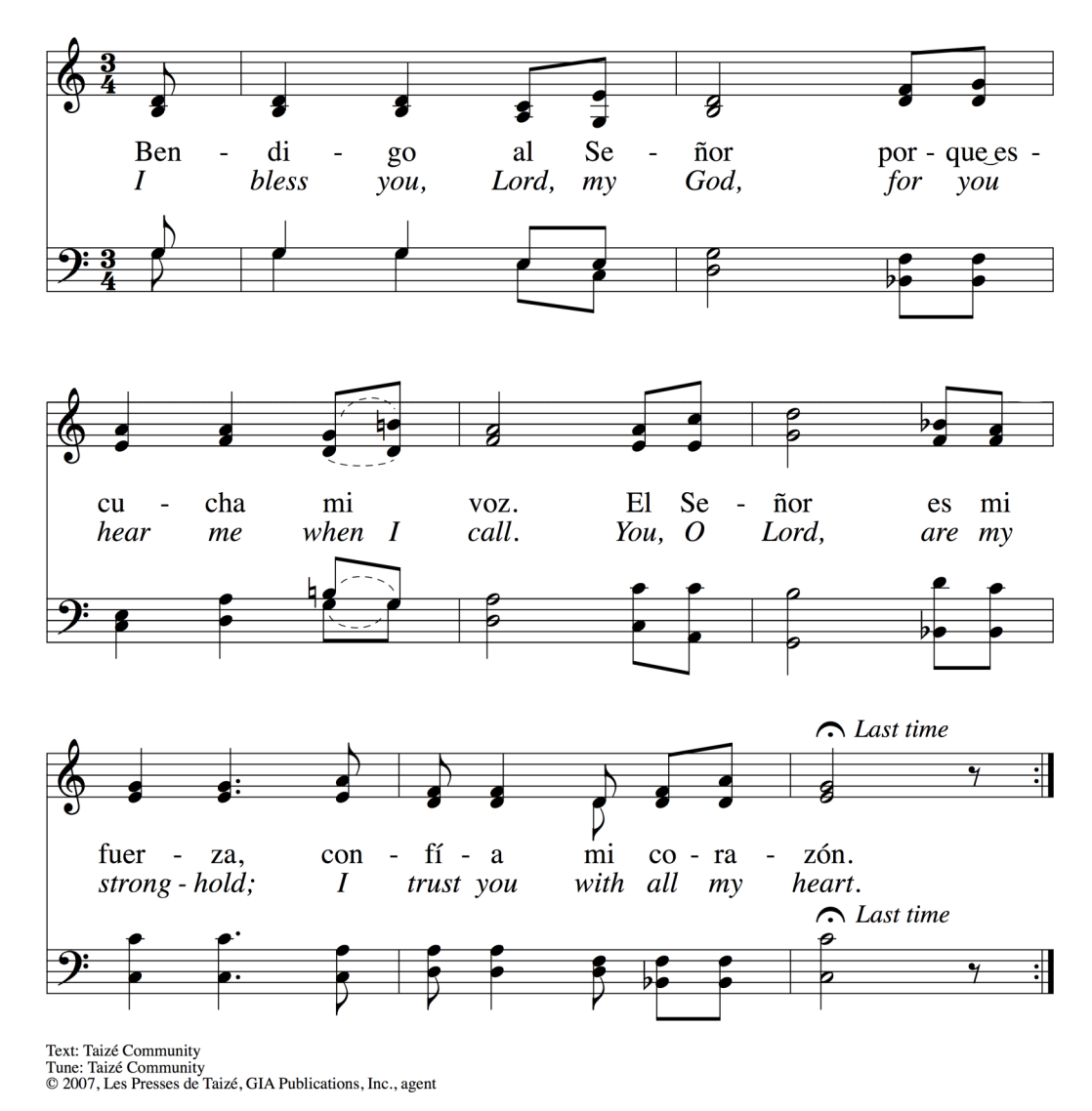
Bendigo al Señor / I Bless You, Lord, My God