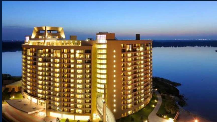
A Romantic Getaway 150 points