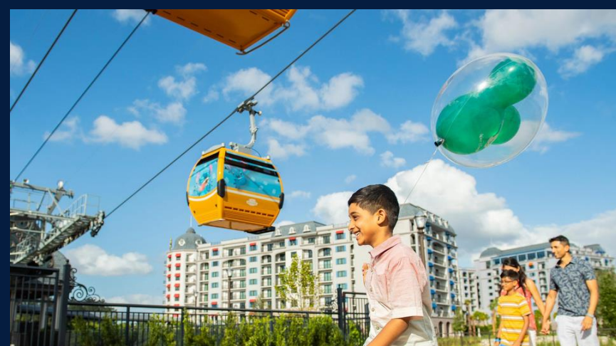
A Family Vacation 205 points