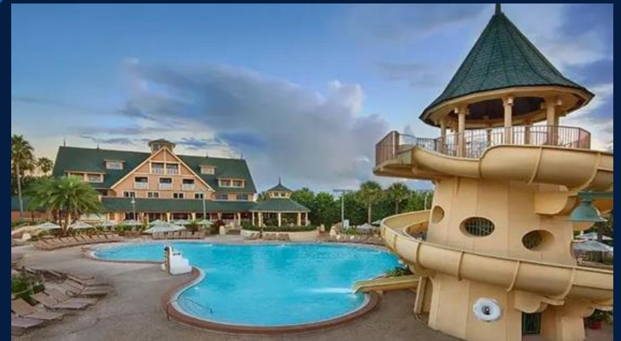
Old Friends Reunion 367 points