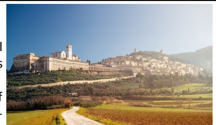
[from Catholic Diocese of Portsmouth e-News Issue 527]