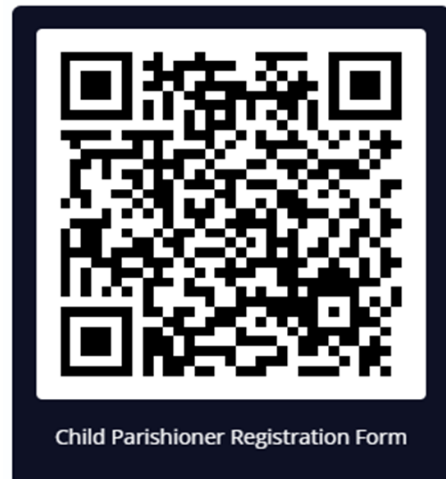
Child Parishioner Registration Form