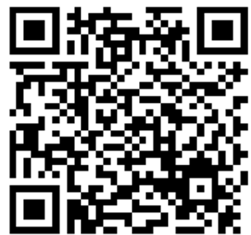
Child Parishioner Registration Form