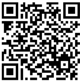
Adult Parishioner Registration Form

If you have any questions or need assistance registering, please contact the parish office.