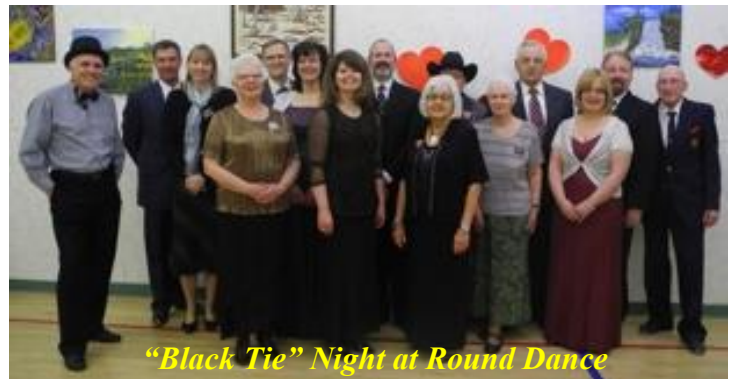
"Black Tie" Night at Round Dance

Other dancers love coming to our club because we are warm, friendly and welcoming and our dances are always fun. This doesn't happen by accident. It takes a wonderful group of people, a lot of planning and a lot of organizing. But it's all worth it. We have the opportunity to be an innovative and leading group for the dancing community and we're proud of that.