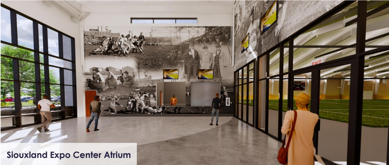
Siouxland Expo Center Atrium