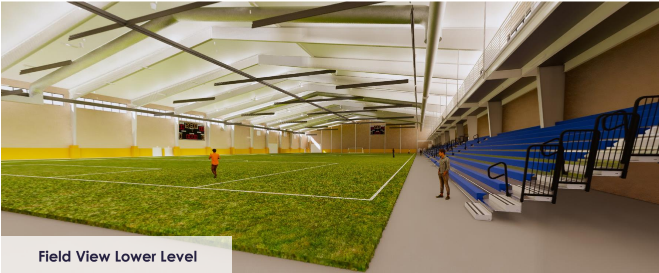
Field View Lower Level