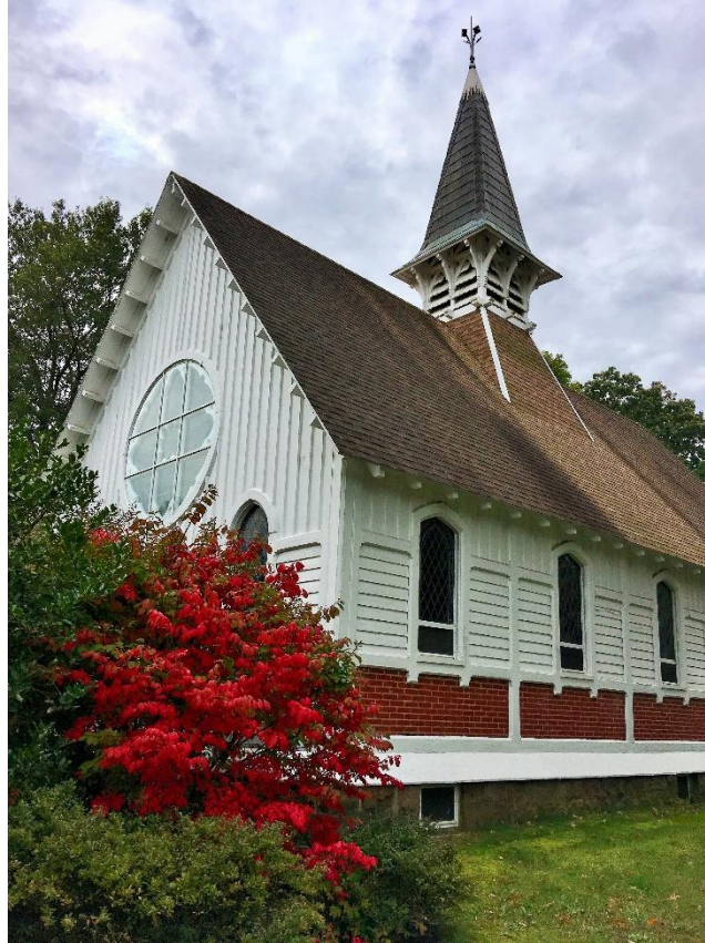
Providence Presbyterian Church of Bustleton