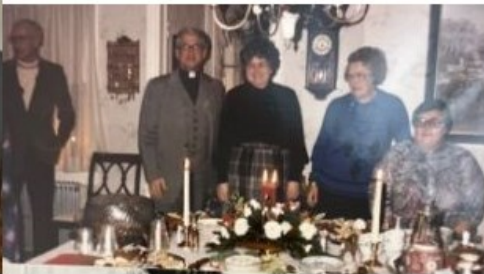
Christmas Social gathering at Manse