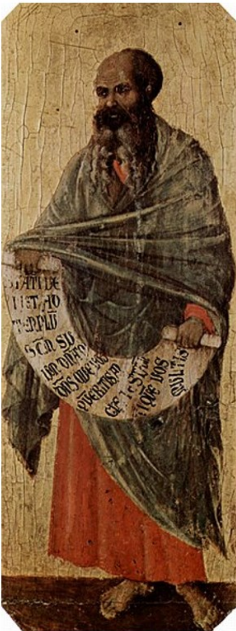
The Prophet Malachi by Duccio di Buoninsegna, c. 1310

God sent his only Son Jesus Christ to meet with us at the level of our most basic humanness – at the Table – “which involves our need not just for food but for each other. I need you to help fill my emptiness just as you need me to help fill yours. As for the emptiness that’s still left over, well, we’re in it together, or it in us. Maybe it’s most of what makes us human and makes us brothers and sisters” (Frederick Buechner). Jesus shared meals with people he loved throughout his earthly life – common suppers, miraculous feasts, a wedding banquet, and the covenant commemorations. On the night before his death, Jesus shared bread and wine with his disciples and asked them to remember him by keeping this feast. Come this Sunday as we gather at the Lord’s Table and join with all the faithful in heaven and on earth in offering thanksgiving to our God.