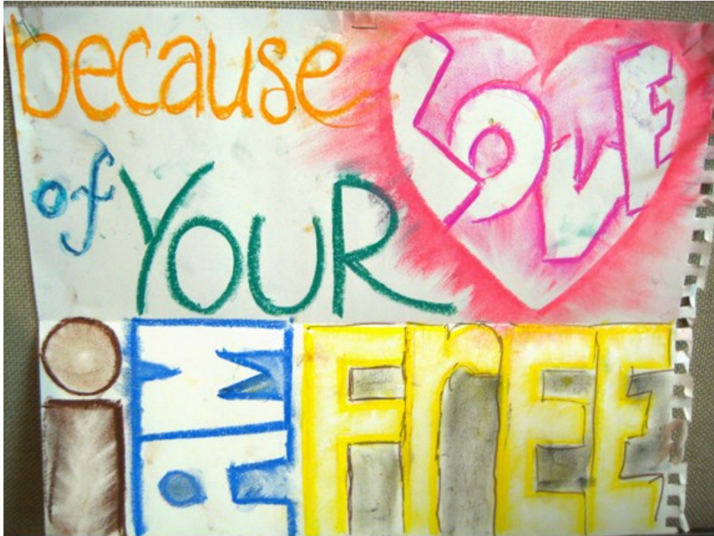
Lingnan University, Hong Kong, China

“Where the Spirit of the Lord is, there is freedom.” ~ 2 Corinthians 3:17b