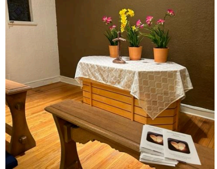
Left: Palm Sunday, center: Maundy Thursday, right: Easter Sunrise Service)