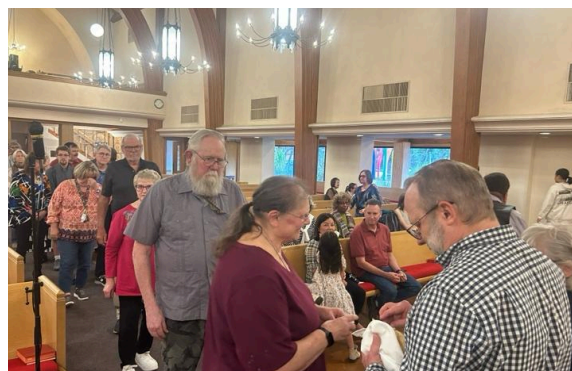
Left: Maundy Thursday readers, center: soloist, right: Holy Communion)