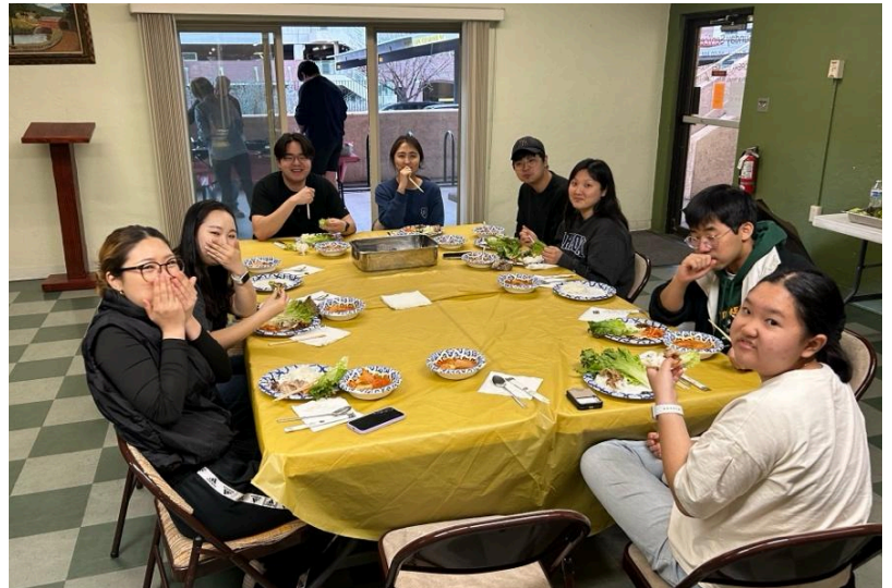
Left: Cooking the pork belly for the gathering, right: students enjoying the gathering during their spring break.