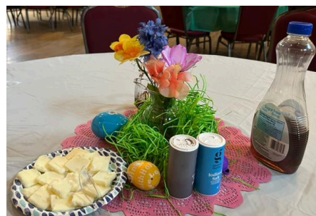
Left: Easter Brunch table plate, center: fellowship food table, right: table decorations)