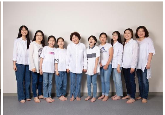
Left: My sister-in-law and niece in San Francisco