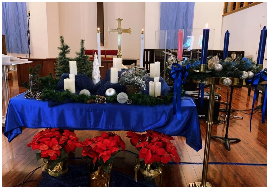
(Altar decorated for the season of Advent)

Our new church season began on Sunday, Nov 28. It always comes right after Thanksgiving Day. The season of Advent, which comes from the Latin word adventus meaning "coming" or "visit," begins four Sundays before Christmas and ends on Christmas Eve. Advent is the beginning of the church year for Christians.