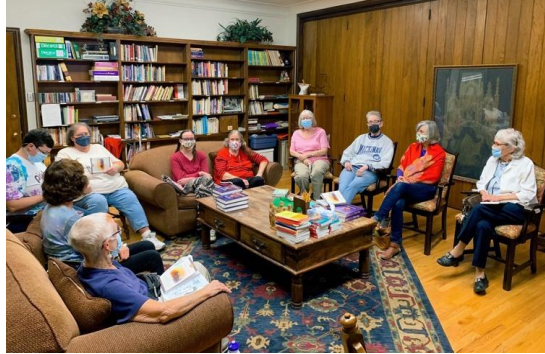
(Advent Book Study group)

The founder of the Methodism movement, John Wesley's brother (Charles) is a great hymn writer. One of Charles Wesley's hymns is “Come, Thou long expected Jesus.”