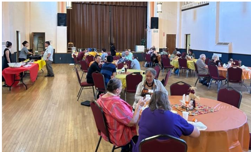
Left: Food at the Corn Roast