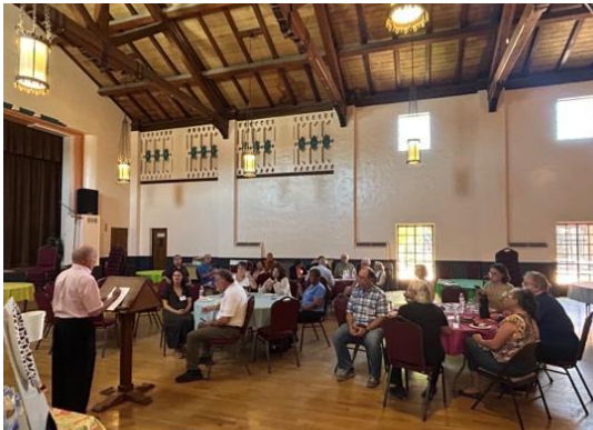
Left: South District Clergy Gathering.