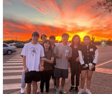
Left: Korean Young Adult group gathering Right: Sabino Canyon moonlight tour