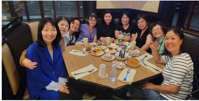
Korean Clergy group of the Northern Illinois Conference

The Bible offers valuable guidance on the principle of hospitality. In the book of Hebrews, we find this inspiring verse: “Do not forget to show hospitality to strangers, for by so doing some people have shown hospitality to angels without knowing it.” (Hebrews 13:2, NIV)