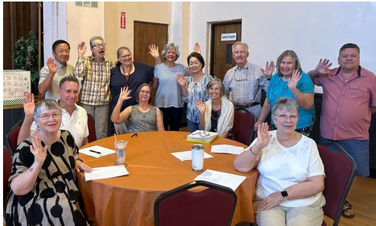
Church leaders who participated in the Church Conference on October 7 th .