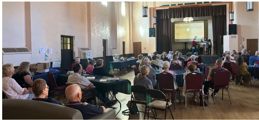
The Arizona State Museum used the social hall for their presentation on November 4 th .