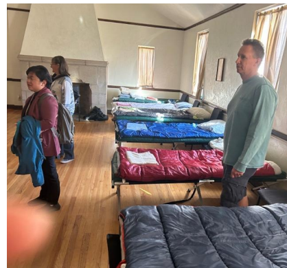
Mountain Sky Conference volunteers stayed at our church for their gathering from October 30 to November 3. Our church showed radical hospitality providing their lodgings, three dinners, snacks, and a conference room area.