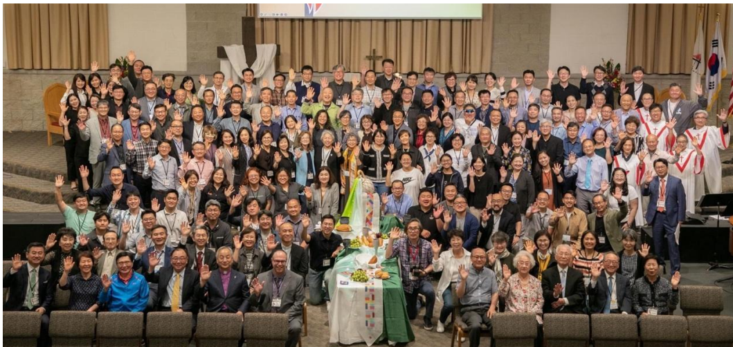
Group picture of the Special Korean Clergy Conference

Radical Hospitality goes beyond the surface of inviting family and friends into our homes for a feast. It’s about welcoming not just those we know well, but also those we don’t know, into our lives. It is an extension of the Thanksgiving spirit throughout the year and a commitment to building connections within our community. After I participated in a Special Korean Conference in Chicago, Illinois early in October, I am fully recharged and ready to practice radical hospitality thanks to your support and prayers.