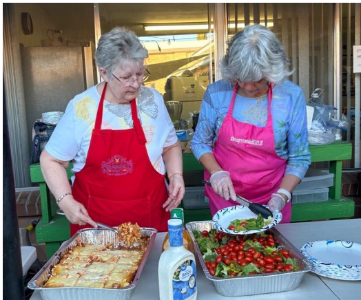
Below: Our Heaven's Touch Ministry was held at The Loving Church on November 5th.