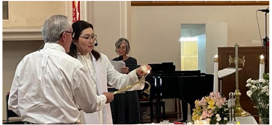
Above: All Saints Sunday worship service was held on Nov 5th.