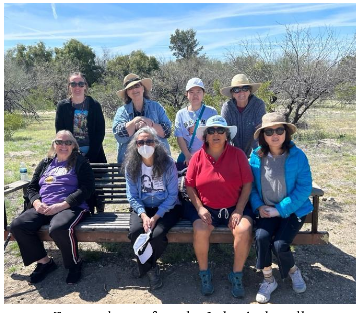
Group photo after the Labyrinth walk