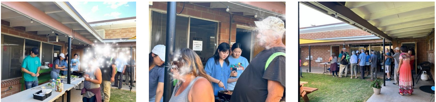
Above: Every Sunday, the Loving Church worships at 3:00 PM, and after the service, they serve hot meals to the homeless people. Our young adults helped them to distribute the food while the Heaven's Touch ministry is in process.