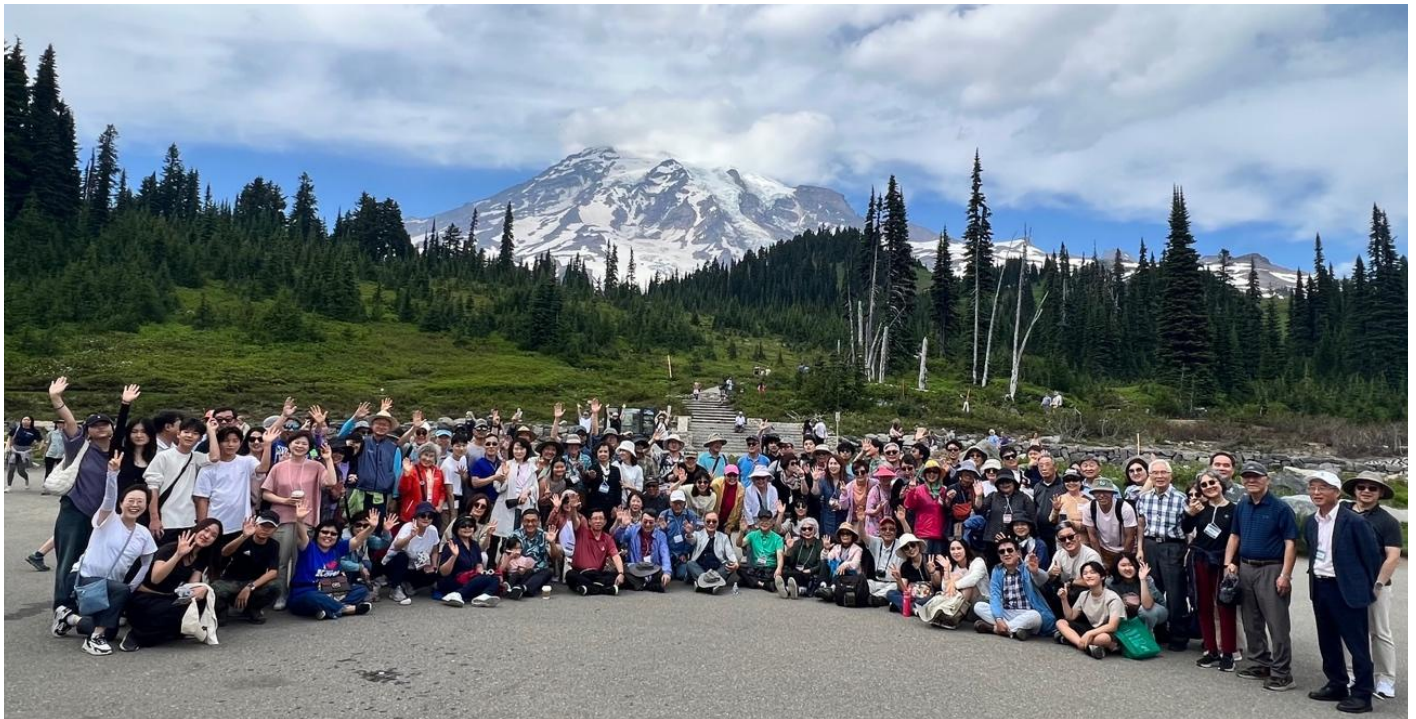
Group picture of the Western Jurisdiction Korean Clergy family retreat @ Mt. Rainier