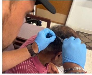
Taking out some staples from the homeless brother's head.