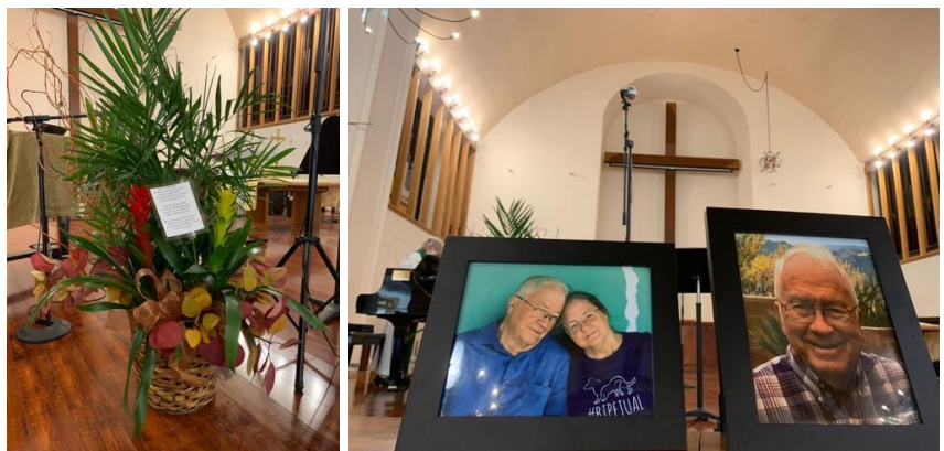
Left: Plant arrangement dedicated for the service.