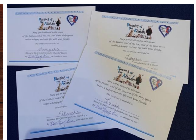
Left: One of the slides in the Blessing of Animals slideshow. Right: Certificates for the Blessing of Animals.