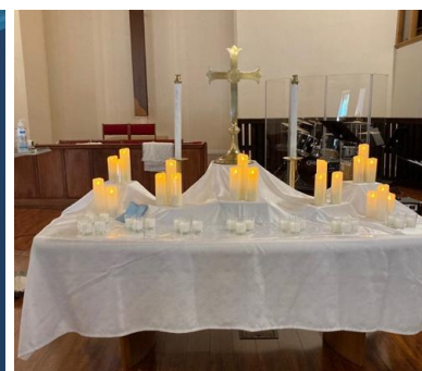
Left: One of the slides from the All Saints presentation.