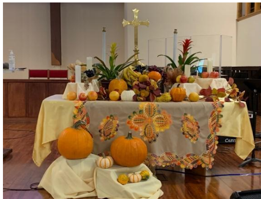
Altar decorated for the Thanksgiving Sunday

If we offer our generosity fully and authentically, it will touch so many others at the end. That is the true value of the generosity of Jesus Christ.