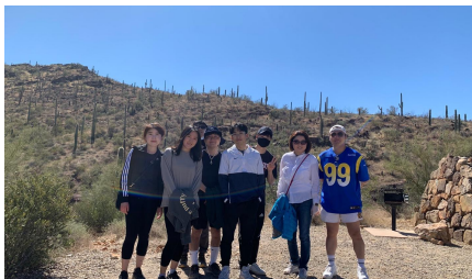
Below: Students at the top of the mountain trail

Not only that, but I also learned that several of them didn't grow up Christian. It gives me more burning passion and motivation to help them to receive the grace of God and authentic faith in the Methodist Church regardless of which church they attend where they will settle down after finishing their study.