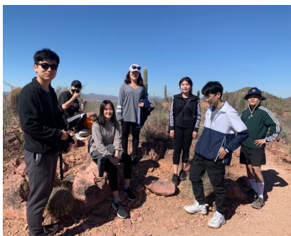
Above: Students after the trail