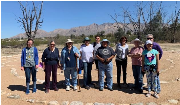
Group photo at the park