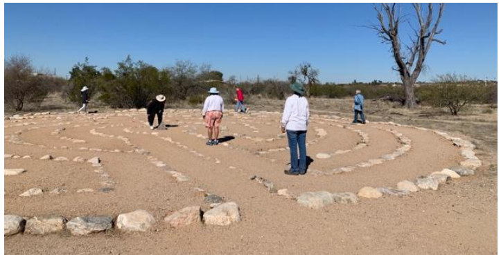
Walking the Labyrinth