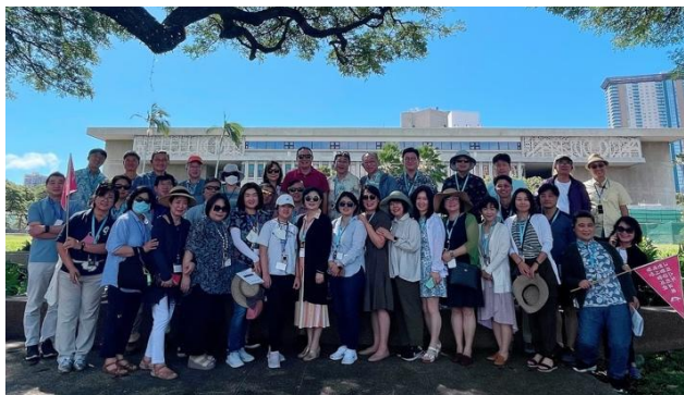
Left: PIM group photo