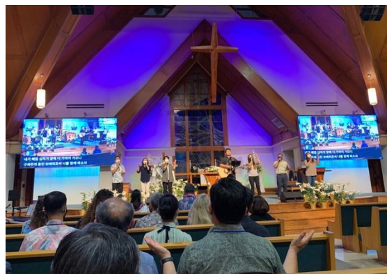
Right: PIM opening worship