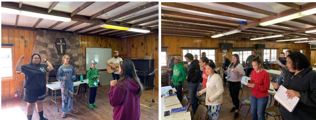
Young Clergy Retreat worship