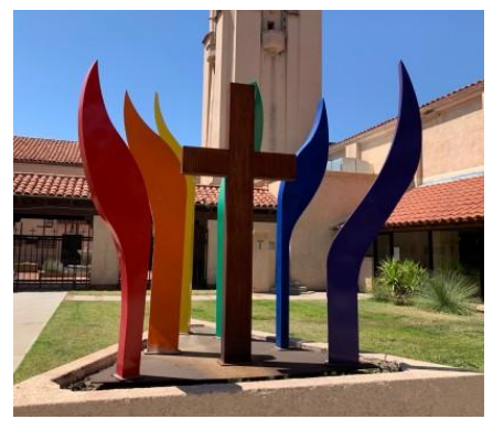
Our rainbow sculpture

"Each year on March 31, the Human Rights Campaign honors International Transgender Day of Visibility, a time to celebrate transgender and non-binary people around the globe and acknowledge the courage it takes to live openly and authentically."