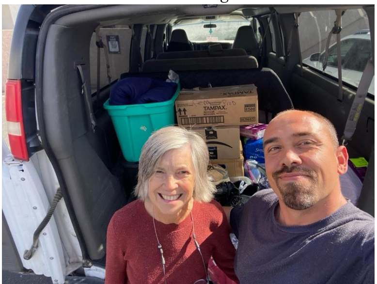
(continued next page)