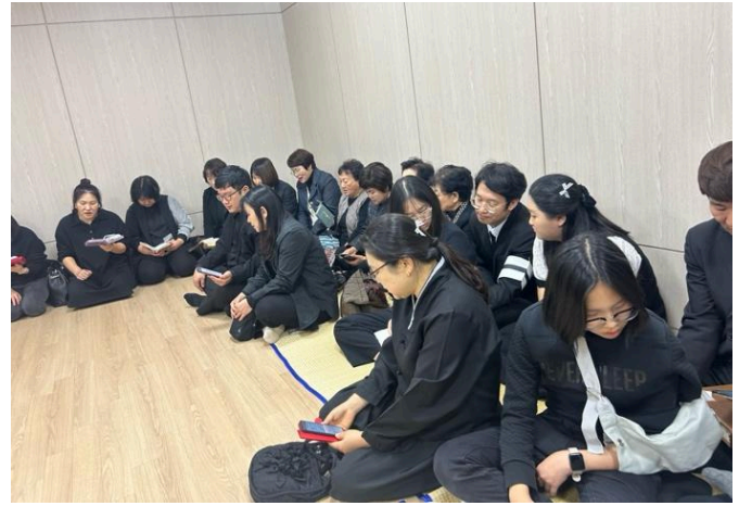
Memorial Service (Service of Comfort) - A service held to offer comfort and encouragement to the grieving family. 11/15/24