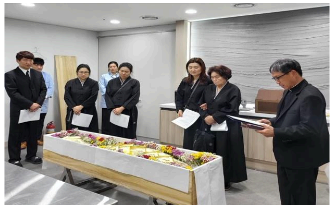
Service of Encoffining - A service held when placing the deceased into the coffin. 11/14/24