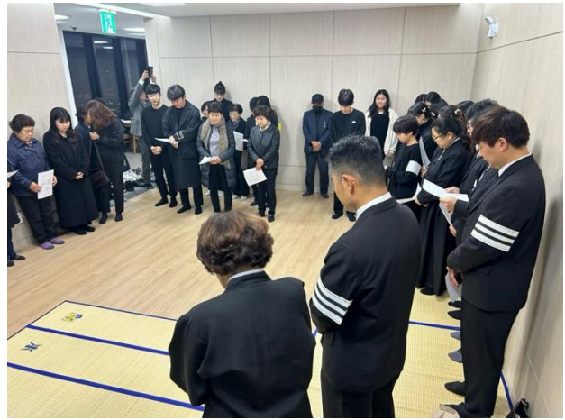
Service of Departure - A service held when the coffin departs the funeral home for burial or cremation. 11/16/24