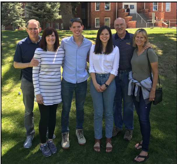
The Bride & Groom with Both sets of Parents