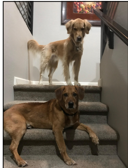
Denali (above) and Barney