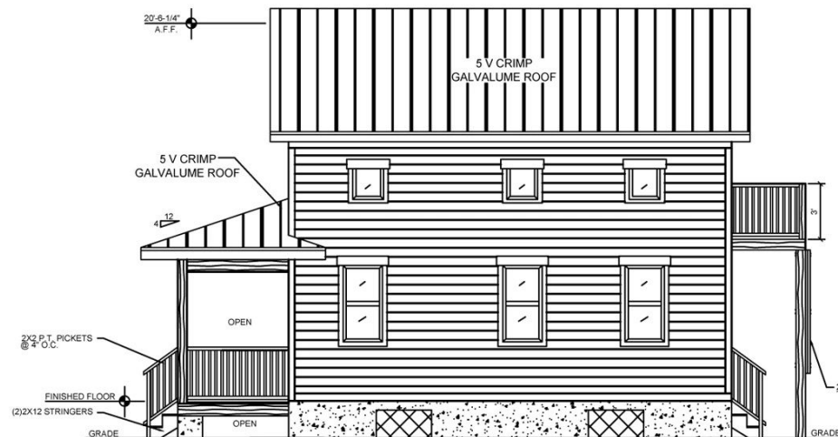
RIGHT (SOUTH) ELEVATION