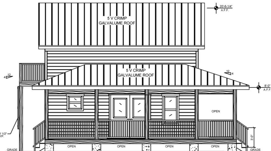
LEFT (NORTH) ELEVATION