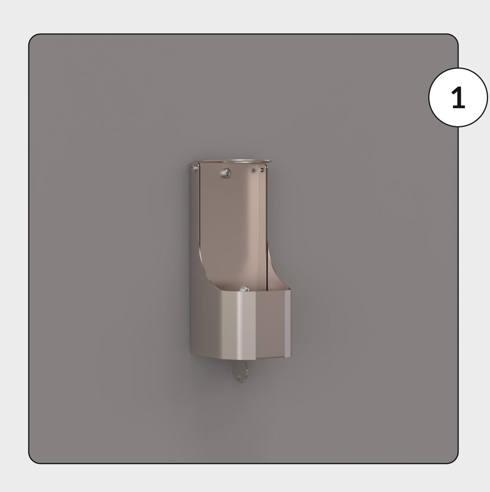
Open the unit with the key provided.