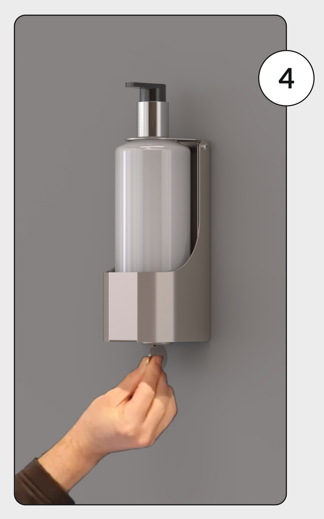
Close the holder and remove the key. The unit is now operational.