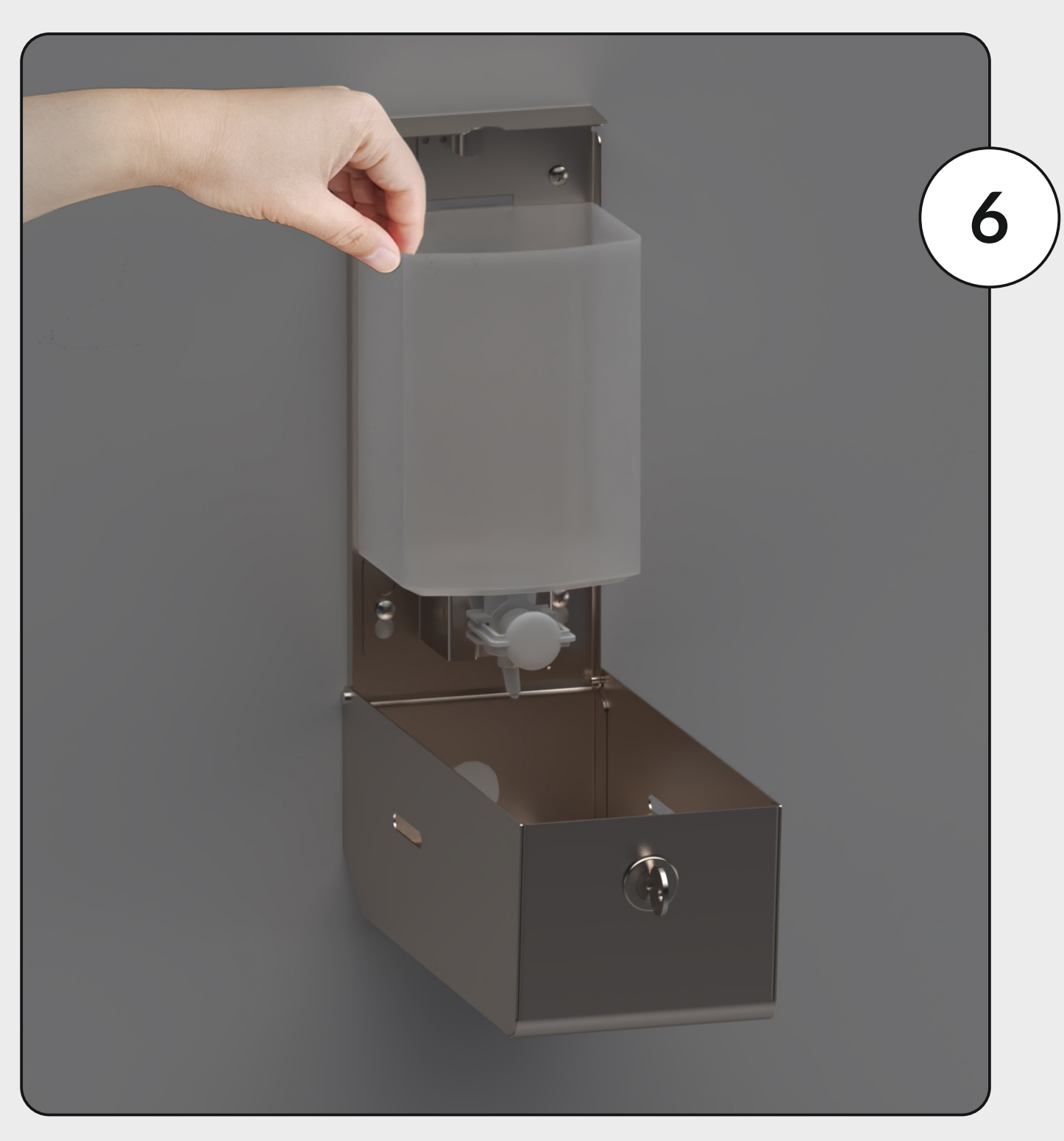
Reattach the reservoir and fill it with the relevant product to the pump supplied.